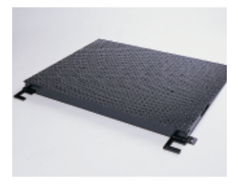
Ramp Provides easy access to 6600 base for towmotors and pallet jacks. Add 2 ramps for easy on-off weighing. Hooks on front of ramp and lagging tabs securely hold base from moving.