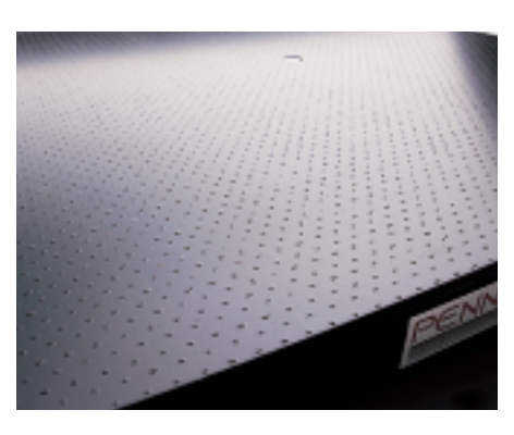
Non-Slip Finish The new generation of slipresistant surface for the most demanding wet or dry industrial installation. Manufactured with a patented cnc laser process, the ideal choice where a non-slip surface is important.