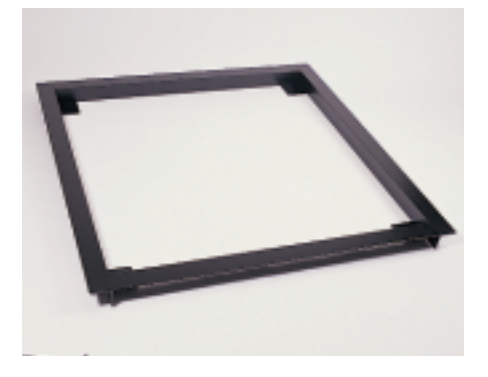
Pit Frame w/ Pit Kit Allows easier pit installation of 6600 base. Pit frame doubles as form for pouring concrete. Available in painted mild steel or stainless steel construction.