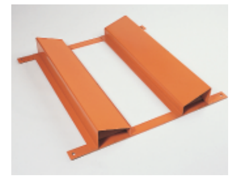
Coil Steel Cradle Sturdy cradles provide safe and secure weighing of coiled product. Cradle positions coil for maximum weight accuracy.