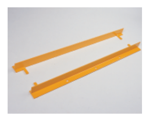
Bumper Guards Simple yet efficient design protects 6600 base from accidental hits from towmotor forks. Painted safety yellow for high visibility.