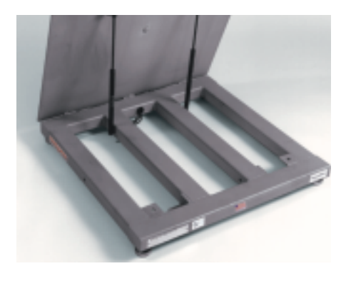
Lift Top Hinged deck plate allows easy underbase cleaning. Gas charged struts make raising and lowering deck plate by hand a snap. Plate is held in closed position by mechanical fasteners.