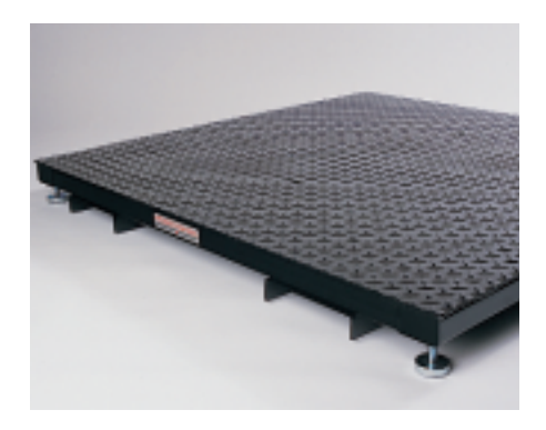
Fork Lift Skids Makes moving a base with a towmotor fast and easy. Fork lift skid option includes extended leveling feet. All load cell wiring is protected inside steel tubes.