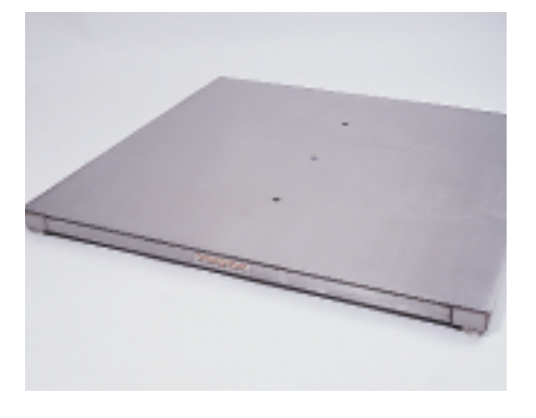
220 Grade S.S. Finish This highly polished finish is ideal for pharmacutical, petro-chemical and food applications.